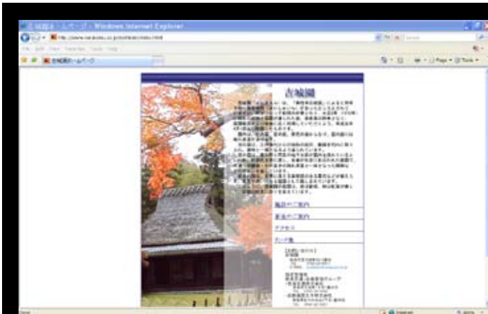
Yoshikien Garden in Nara City http://www.narakotsu.co.jp/yoshikien/index.html

From September 6, 2008, the Nara Prefectural Government is extending their hospitality to foreign visitors by offering complimentary entry to the garden and museums under their management. Simply show your passport and the entrance fee is on the house. You can find out more from http://www.pref.nara.jp/english/ or the site links below.