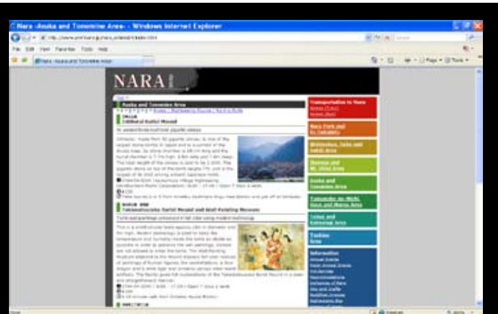
Nara Prefectural Complex of Man'yo Culture in Asuka village http://www.pref.nara.jp/nara_e/area04/index.html The Museum, Nara Prefectural Archaeological Institute of Kashihara http://www.pref.nara.jp/nara_e/area04/03.html