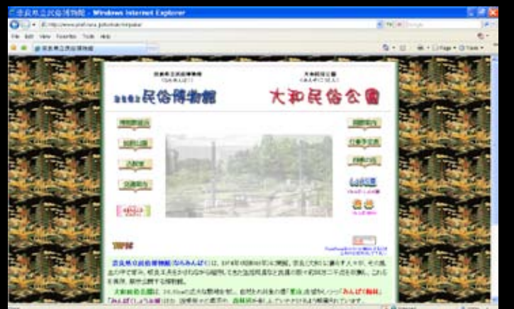
Nara Prefectural Museum of Folk Law in Yamato Koriyama City http://www.pref.nara.jp/bunkak/minpaku/