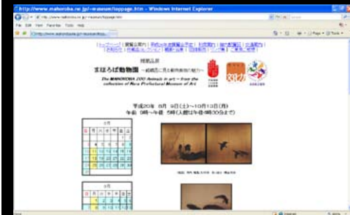
Nara Prefectural Museum of Art in Nara City http://www.mahoroba.ne.jp/~museum/toppage.htm