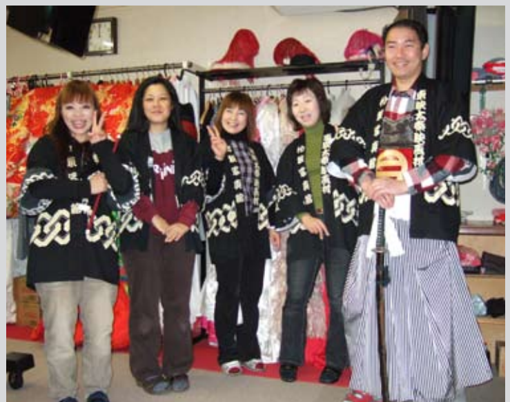
The Makeup Studio