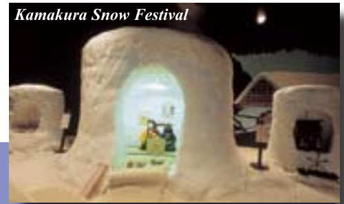
Kamakura Snow Festival